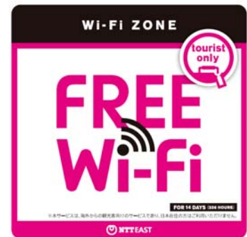
Free Wi-Fi logo

Around 50% of international tourists to Japan wish to use Free Wi-Fi*2. In response to it, free public wireless LAN environment has been developed in many areas such as airports, railway stations, and convenience stores etc. To introduce more convenient services to tourists visiting Japan, JAL takes this new challenge to cooperate with NTT East, who has "Hikari Station" hotspots located at more than 46,000*3 shops and facilities in the eastern Japan*4, to enable tourists to use Free Wi-Fi service during short visit to Japan.